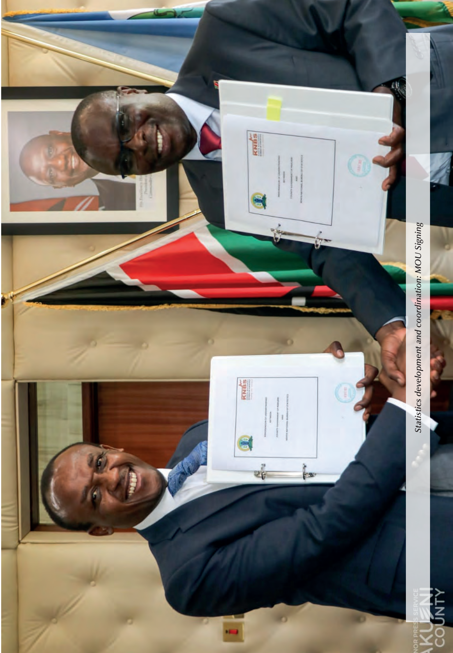
Statistics development and coordination: MOU Signing