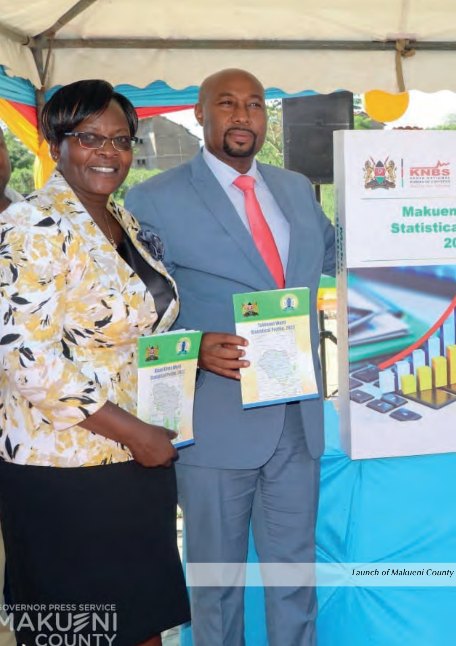
Launch of Makueni County