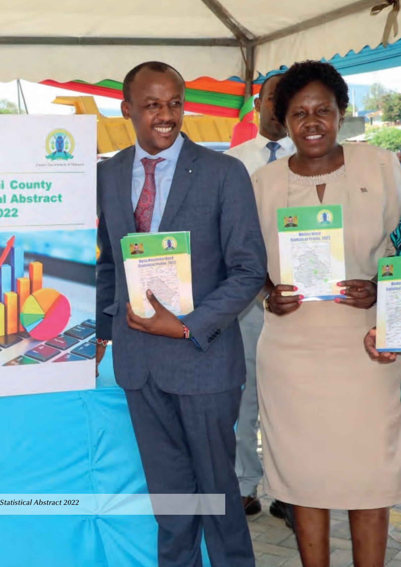
Statistical Abstract 2022