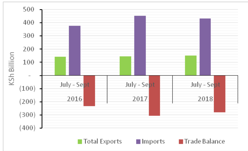
Figure 1: International Merchandise Trade, 3 rd Quarter, 2016-2018