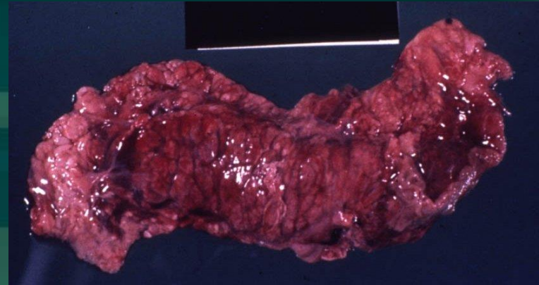
Bleeding Pancreas of an Alcoholic, he's now dead!

How do you think these people turned out?