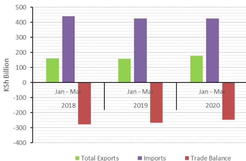
Table 3: International Merchandise Trade 1 , 2018– 2020